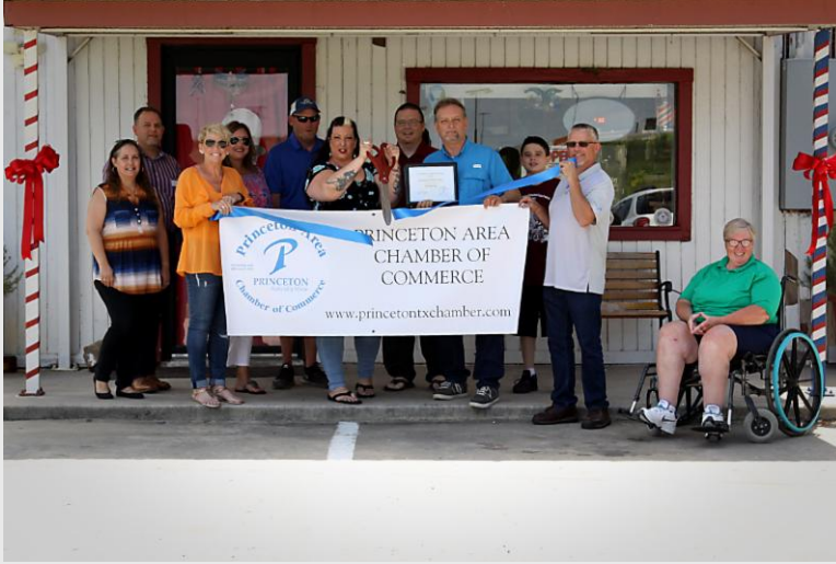
Tickey Dr. in Princeton next to Princeton Floral.